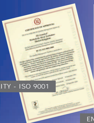
QUALITY - ISO 9001