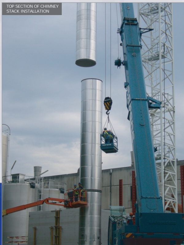
TOP SECTION OF CHIMNEY STACK INSTALLATION