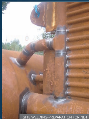
SITE WELDING-PREPARATION FOR NDT