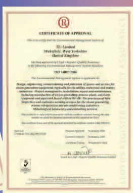
ENVIRONMENT - ISO 14001