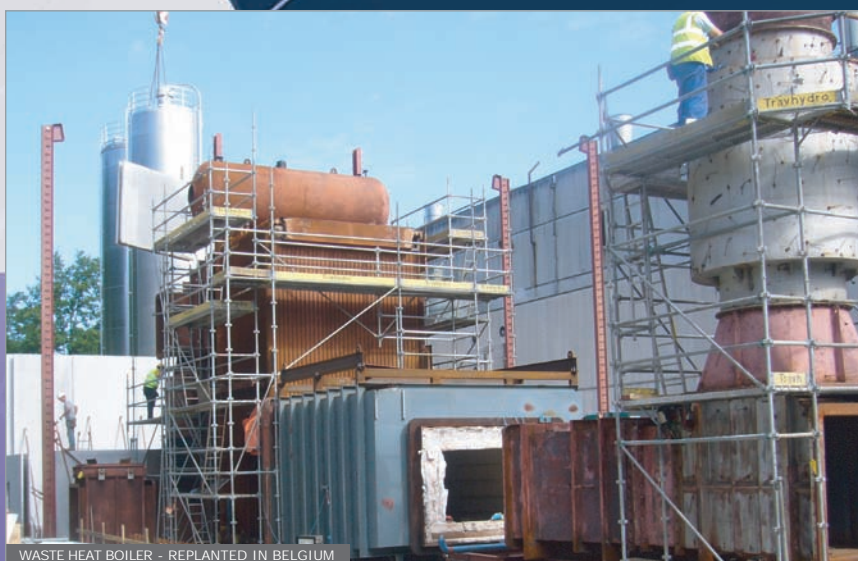
WASTE HEAT BOILER - REPLANTED IN BELGIUM