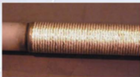
Close up - 2.5mm thick Inconel 625 welded automatically onto 15Mo3 boiler tube.