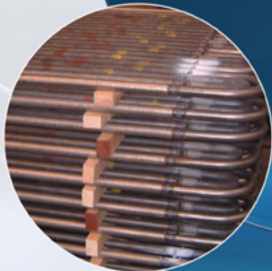
Superheater panels - ready for dispatch