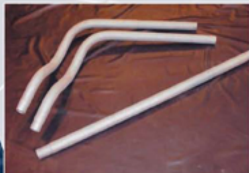
Wall tube - after weld overlay and manipulation.